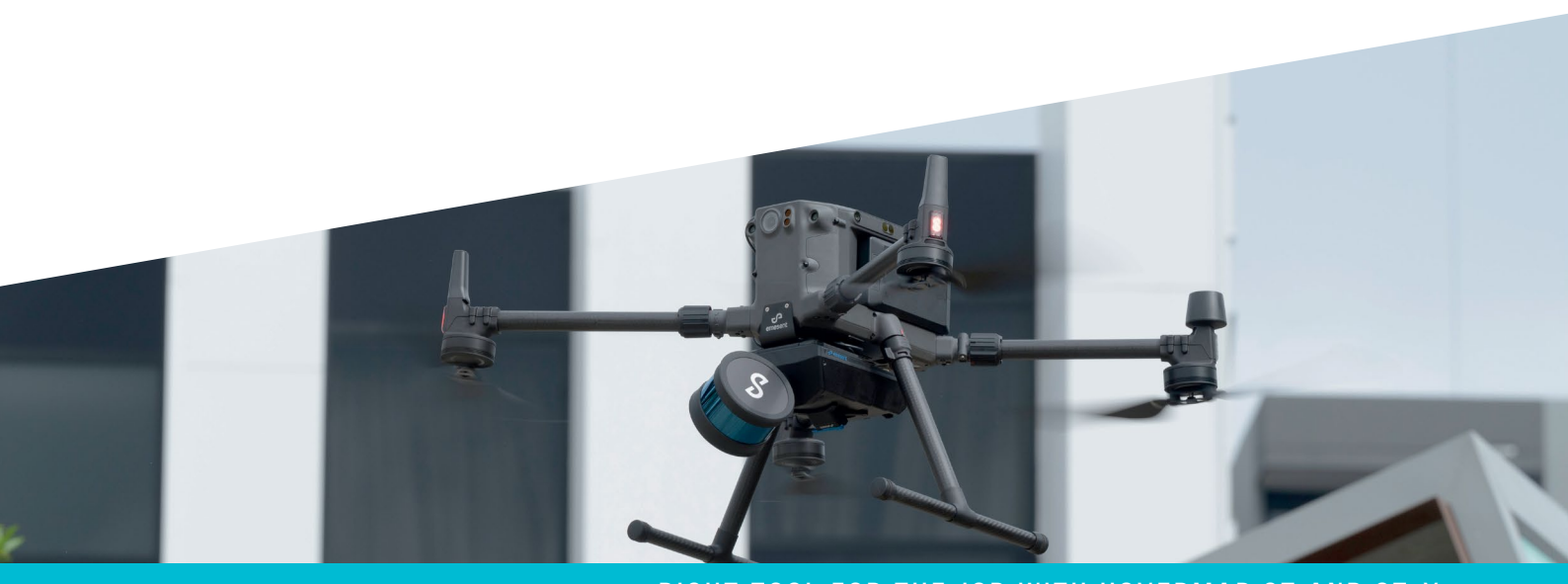
RIGHT TOOL FOR THE JOB WITH HOVERMAP ST AND ST-X.